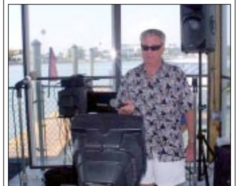
Come join us for... Karaoke on the Patio Saturdays 1:30-5:30PM