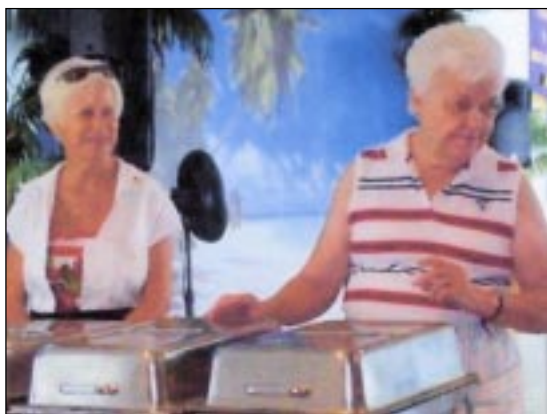
The Elks of Lodge #1912 Shared A Happy 4th of July!