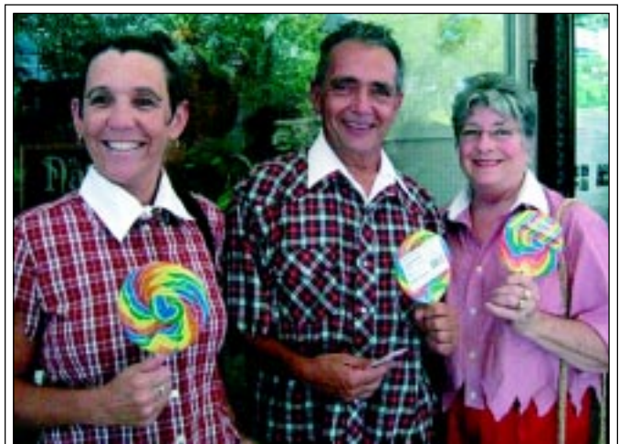
Lodge members make it big as “Lollipop Kids”.

Sincerely, Larry Granucci, Exalted Ruler